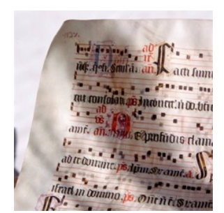
Sunday 17 December Joyful in the Story Nine Lessons and Carols