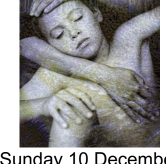
Sunday 10 December Comforted and Uncluttered Peace through clarity of vision