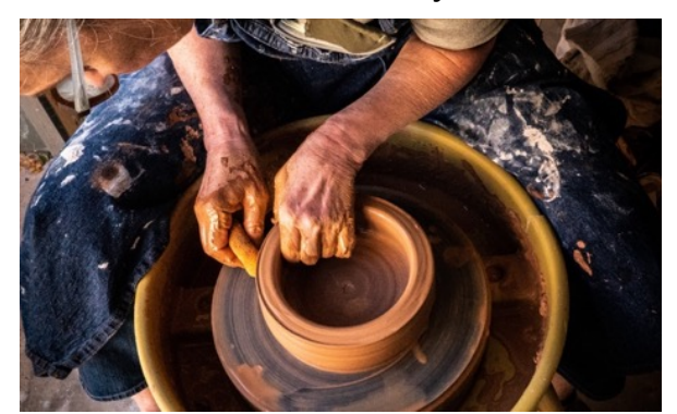
Sunday 3 December Useful and Beautiful Clay fashioned in the hands of God

Searching Israel's ancient wisdom for insights, we explore three aspects of the spiritual longing of those who waited for the coming of the Messiah, with the view of articulating our current hope for the world. On the third Sunday, we tell the Christmas story in our service of Nine Lessons and Carols.